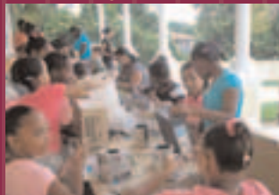
a bevy of kids at the papier mache workshop