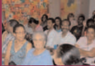
the NAGB enjoyed great crowds at the "poets and writers" series this summer