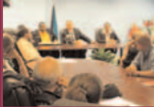
carifesta x meeting