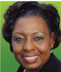
Olivia Atavia Grange, MP Opposition Member of Parliament JAMAICA