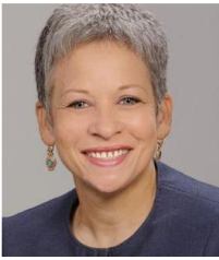
Hon. Glenys Hanna Martin, MP Minister of Transport & Aviation BAHAMAS