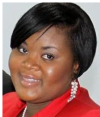
Sen. Sharmá Cudjoe Opposition Senator TRINIDAD & TOBAGO