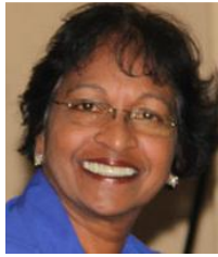
Hon. Indranie Chandarpal, MP Member of Parliament GUYANA