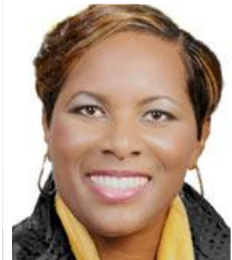
Sen. Hon. Tanisha Tynes Senator BAHAMAS