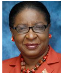
Hon. Vemella Alleyne-Toppin, MP Minister in the Ministry of the People and Social Development TRINIDAD & TOBAGO