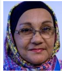
Sen. Hon. Raziah Ahmed Minister of State, Ministry of Gender, Youth and Child Development TRINIDAD & TOBAGO