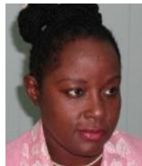
Sen. Camille Robinson-Regis Opposition Senator TRINIDAD & TOBAGO