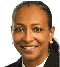
Lovitta Foggo, MP Government Whip BERMUDA