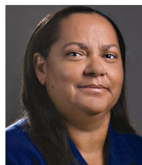
Hon. Juliana O'Connor-Connolly, MLA Speaker of the House CAYMAN ISLANDS