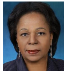
Sen. Helen Drayton Independent Senator TRINIDAD & TOBAGO