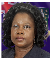
Hon. Alvera Maduro-Caines, MHA Government Benchmark BRITISH VIRGIN ISLANDS