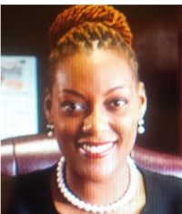
Hon. Akierra Missick, MHA Deputy Premier & Minister of Education, Youth, Sports, Culture & Library Services TURKS & CAICOS ISLANDS