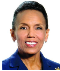
Sen. Hon. Allyson Maynard-Gibson Attorney General & Minister of Legal Affairs Leader of Gov't Business in Senate BAHAMAS