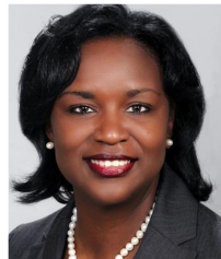
Sen. Hon. Cheryl Bazard Senator BAHAMAS