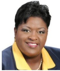
Hon. Melanie Griffin, MP Minister of Social Services BAHAMAS