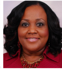
Hon. Natalie Neita Headley, MP Minister without Portfolio Office of the Prime Minister JAMAICA